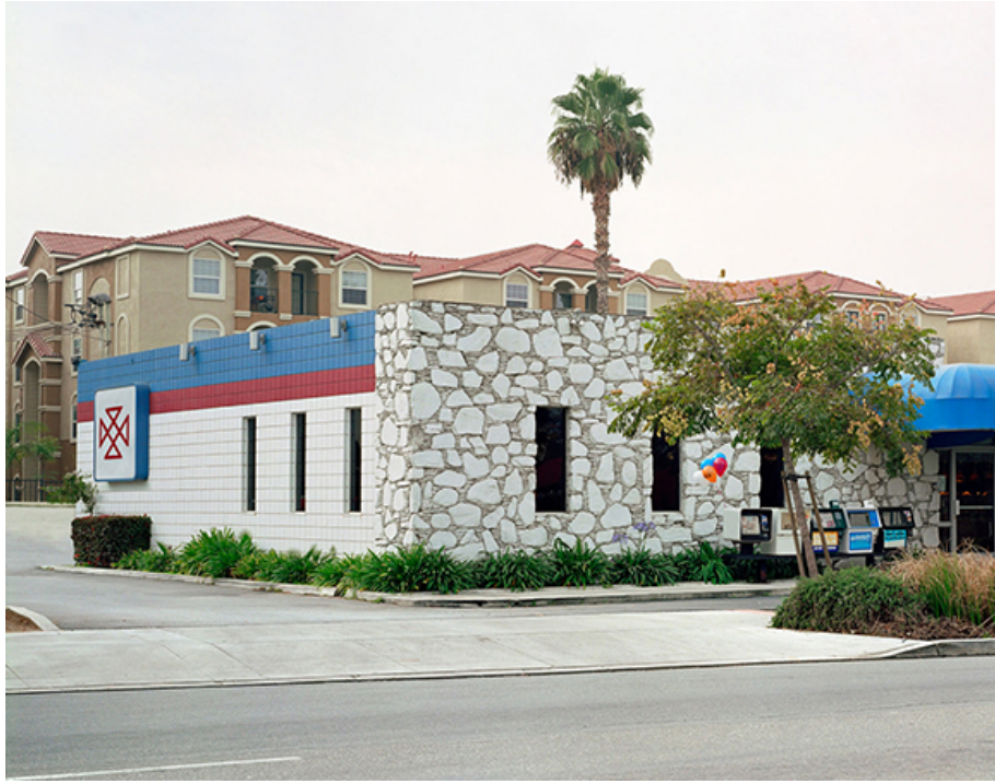
"Untitled (91)" by Amir Zaki

The Inland Empire was one of the first areas settlers flocked to during the California Gold Rush, as it was a luscious and supple green valley area, with a natural water source running through the heart of it -- the Santa Ana River. The wide expanse of the Inland Empire became home to hundreds of thousands, just 50 miles east of the metropolis of Los Angeles, this area had the convenience of being close enough to the major cities of the area, without losing that quiet and spacious attraction that the area was known for. Nowadays, the same rings true. The difference is that somehow over the years, some people started regarding the IE as a wasteful area of nothing. Abandoned homes, buildings, garbage -- even the Federal and State government treated the IE like it was a wasteland. Even though the luscious green valley is now more of a boulder bed of mountains and desert, the IE is still one of the few places in California that has a natural water supply -- the only problem is that now, instead of benefiting our own areas, it is pumped into other cities and areas that do not have a natural water source.