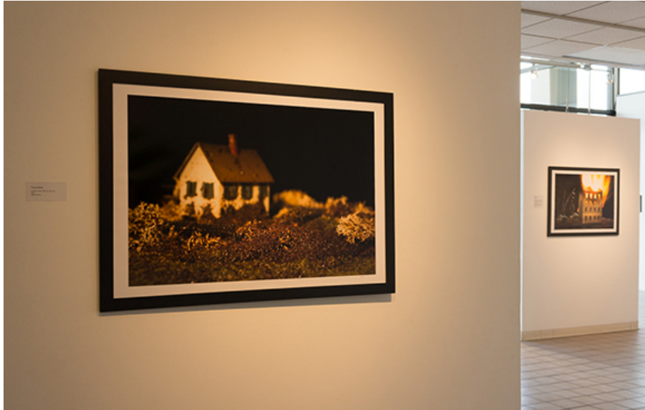
"Being Here" Installation Shot, "Christmas Flood, 2003 #3, Day Two" by Tony Maher